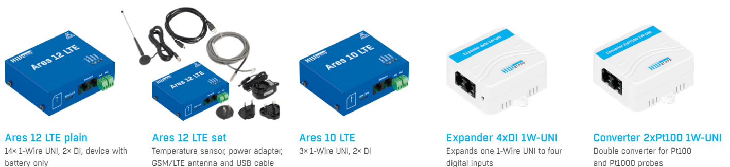
Ares 12 LTE plain 14x 1-Wire UNI, 2x DI, device with battery only