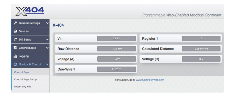
Web-Based Control Page Example