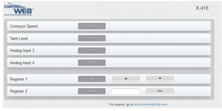
Example X-418 Control Page